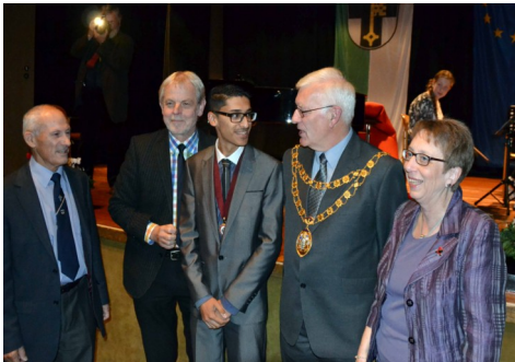
Pic 3 DCM, 40 years: mayors and other VIPs youth of Dorsten