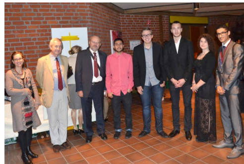
Pic 4 VIPs DCM/40 years: youth of Crawley meets (and town twinning)