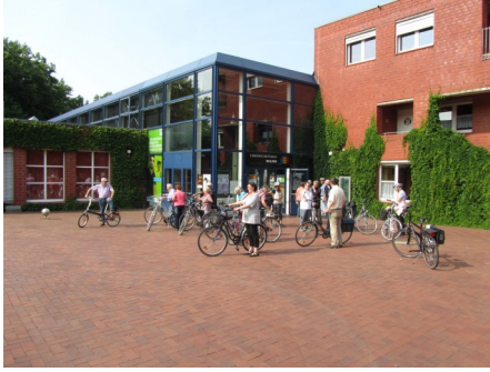
Pic 1: Yearly bicycle-tour around Dorsten 2013: visiting Barkenberg