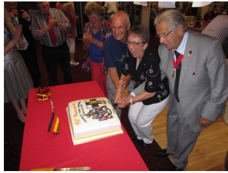
Pic 2: MGV: Cutting the 40 Years cake